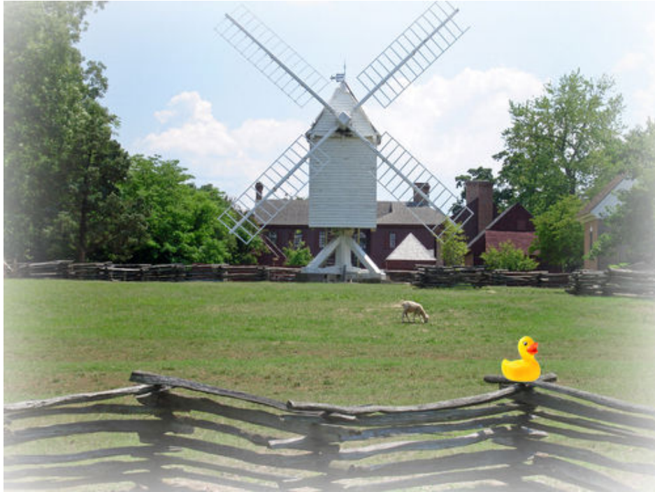
Williamsburg and Duck